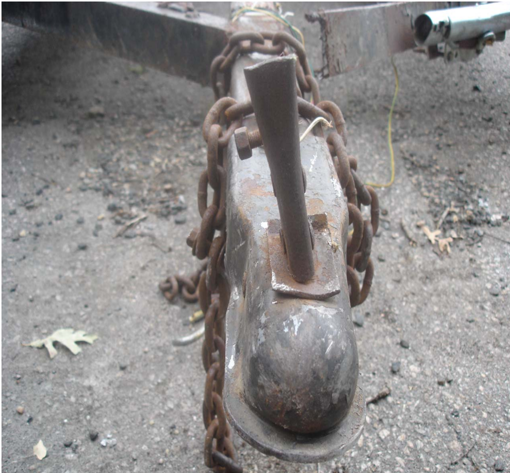
Top view from the front of the trailer coupler and chains

the trailer. Constructed in 1985, the steel trailer was composed of parts from a mechanical automobile lift and two axles from a mobile home. It had a flat bed without sidewalls or tailgate. The coupler on the trailer was compatible with the two-inch ball hitch on the truck; however, this latching mechanism was an older style. It consisted of a shallow concave rectangular metal plate that applied pressure to keep the ball securely seated in the coupler. This device was well worn and may have been defective prior to the crash. The lever on the coupling mechanism, which was bent and rendered the device defective after the crash, did not have a location to insert a locking pin to secure it in place.