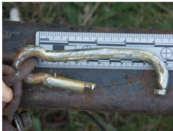
Carabiner Clip from this crash.

The run-away trailer was a key item of interest for the Crash Investigation Team. The question of how and why it broke away from the pickup was an initial concern. The high rise truck violated equipment specifications and, even with the drop-style hitch, was too high for a proper mount with the coupling mechanism. The nine-inch difference between the ball on the hitch and the receptacle on the trailer lifted the tongue of the trailer and forced the bed to slant downhill from front to back. With the bed no longer level, unnecessary stress was placed on the ties securing the aerator to the trailer. The lack of a level mount between the two vehicles may also have kept the latching device from locking completely into position. The pickup driver reported that he felt the trailer come loose when he hit a very slight dip in the road as he entered the left turn lane. The dip may have been enough to jar open the latch and uncouple the hitch, transferring the full weight of the trailer to the tow chain and the aluminum “carabiner” clip. A chain is only as strong as its weakest link, and this clip was not designed to support the weight of a trailer. It stretched open and broke, releasing the trailer.