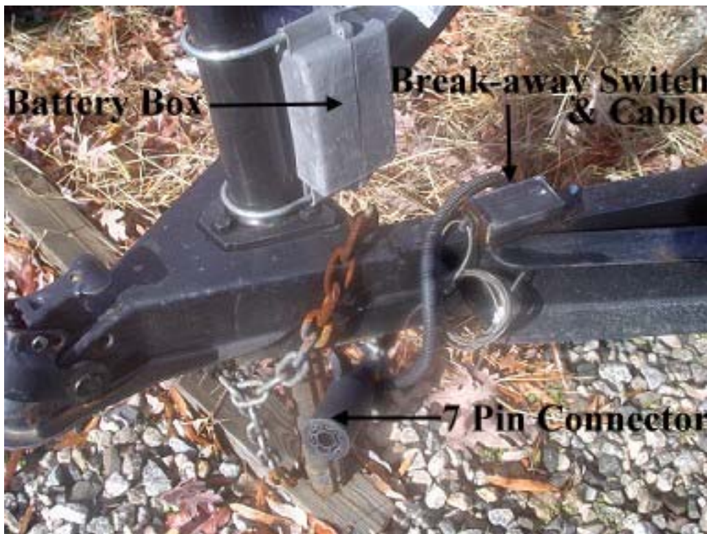
Example of trailer coupler with a seven-pin connector at bottom center, battery box at top center (attached with metal “U” bolts) and the breakaway switch and cable just right of center.

The trailer on this vehicle had several violations that would have been obvious to an observant law enforcement officer. As a first red flag, the trailer did not display a valid license plate. The fact that it had two axles would indicate that it probably hauls sufficient weight to mandate it having brakes, giving an officer reason to look more closely at the vehicle. When viewed from the left side, the state inspection approval sticker and county sticker were not in evidence. From this vantage point, a quick glance would also reveal the absence of a battery box and emergency breakaway activation switch for the brakes. During a cursory visual inspection while driving by, an officer could have easily identified a minimum of five potential violations.