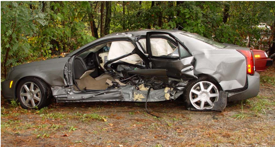
Left side of Cadillac: note damage starts behind front wheel and deepens at "B" Pillar

across from the final rest of the trailer and the Cadillac. Drivers in vehicles in front of and behind the Cadillac, as well as one who had been following the pick-up truck, all stopped and ran to the damaged car. Several called 911 on cell phones, requesting emergency help while others attempted to assist the driver, who was pinned in her seat, unconscious and apparently without any pulse or respiration. Minutes later, fire, police and rescue units arrived. Emergency personnel determined that the Cadillac driver was deceased and her body was transported to the local Medical Examiner's office. Police gathered evidence, interviewed witnesses and made arrangements to have the car and trailer towed to storage facilities. They cleared the scene approximately three hours after the crash; however, Virginia Department of Transportation crews required another three hours to complete repairs to the traffic signal box and restore mechanical controls to the intersection.