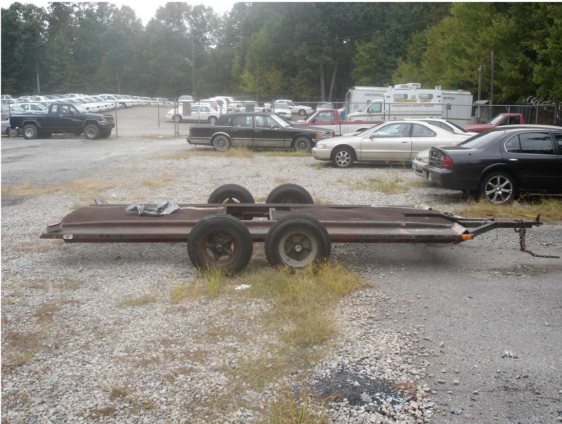
View from right side of trailer: note absence of battery box and breakaway switch.

Drum brakes were installed on the trailer's front wheels; however, there were no wires connecting them to the electrical harness. Consequently, the brakes were present but not operational. Without the appropriate harness, the brakes could not be connected to a power unit. Thus, they could not be activated in the towing vehicle through application of the service brake pedal or with a hand-operated lever. Additionally there was no emergency breakaway system, as required by Virginia State Code and inspection rules and regulations, to activate the brakes should the trailer come loose from the towing vehicle. Such a system would have included a switch that trips when a trailer disconnects and a battery to power the braking mechanism when the switch is tripped. Since the trailer was equipped with brakes, by State Code the brakes were required to function and the trailer was therefore required to be inspected. This trailer had no inspection approval sticker on it.