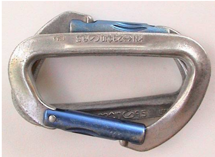
Exemplar Carabiner Clip

about 250 pounds, the day before and placed it in the back of his truck. He picked up the trailer the morning of the crash. In order to get the equipment out of the pick-up bed, he had to disconnect the trailer. After using the aerator, he reconnected the trailer to the truck using a ball hitch that fit the coupler on the trailer and a worn steel chain that attached to the truck with an aluminum “carabiner” type clip for a lock.